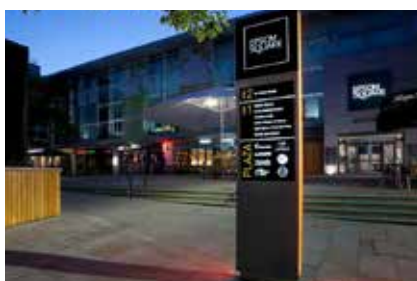
Epsom Square 3,000 – 8000 sq.ft A3 Unit To Let