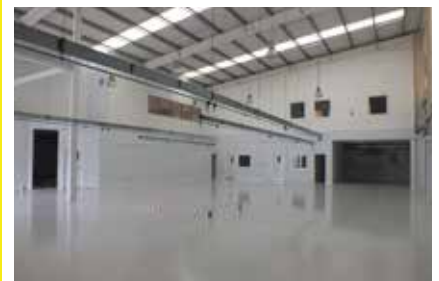
Mitcam Unit 5 Falcon Business Centre 14,500 sq.ft HQ Warehouse Sold