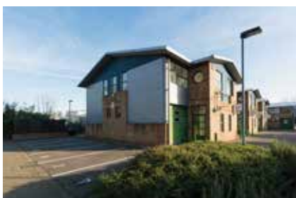
Epsom – First Quarter From 1,485 sq.ft To Let for Canada Life